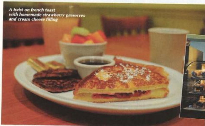
A twist on french toast with homemade strawberry preserves and cream cheese filling

Lunch and dinner is equally satisfying with juicy burgers and sandwiches made to order. Latte Da offers dozens of hot or cold sandwich combinations, all served on a choice of over 20 breads or bagels. Try the BLT - basic, but a perfect lunch when paired with a generous portion of Latte Da's exceptional fries.