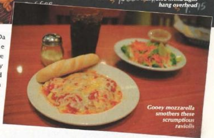
Gooey mozzarella smothers these scrumptious raviolis

Looking for a quick, healthy breakfast sandwich and a hot cup of coffee on the way to work? Latte Da opens weekdays at 6am.