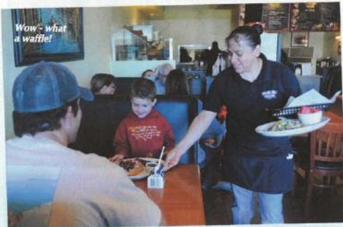
Wow - what a waffle!

Highly recommended are the buttermilk pancakes. This family recipe is made from scratch with real buttermilk, and are light and fluffy yet hearty enough for a big appetite. Top them off with fresh blueberries, fresh-cut