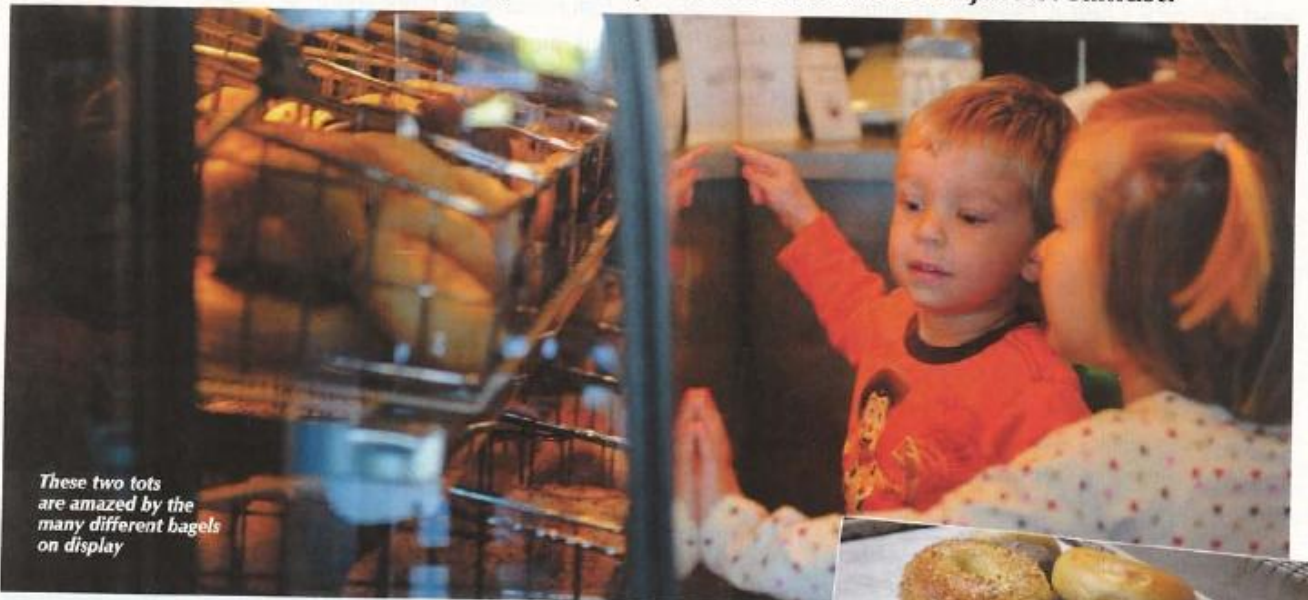
These two tots are amazed by the many different bagels on display

This quaint Trabuco Canyon eatery has much more than just breakfast!