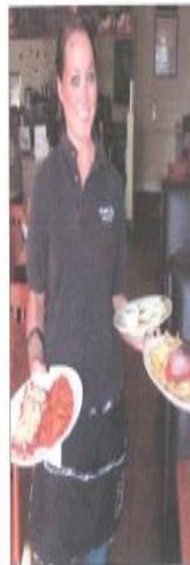
Excellent service with a smile!

Latte Da Bagelry & Grill offers their customers breakfast, lunch or dinner made fresh all day every day.